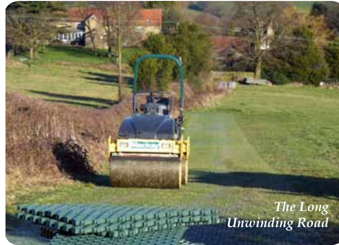
The Long Unwinding Road

Once the grass grows through it, you'll scarcely know it's there. The rain will drain through and we can still take a grass crop off before every festival. But the really good news is that we won't need to hire in that expensive (and ugly) steel roadway to guarantee access to the event arena. We've had to put some of our own money up towards it to qualify (Well, every silver lining has a cloud – Ed) but over time this will save us a shed load of cash.